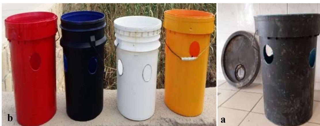
Figure 1. (a) The four colors tested trap (b) the inside and lid of the trap.

The experimental design included 64 traps distributed in six or ten replications, each with four treatments (one of each color under study) and adults captured at four different times between early June and late July 2020. SAS procedures were used to analyze the data (SAS Institute Inc. 2003). The GLM procedure fitted a one-way ANOVA model to analyze the data for each density. The data was analyzed using a randomized complete block design (RCBD) with two factors: trap color and time, to determine whether trap color affects the number of female/male captures at four different times. The data were checked for normality and, if deemed necessary, corrected. Duncan's Multiple Range Test ( \alpha = 0.05 ) was used to separate the means. At the P < 0.05 level, the mean differences were considered significant. Additionally, the Mann-Whitney U test compares males' and females' attraction to color traps.